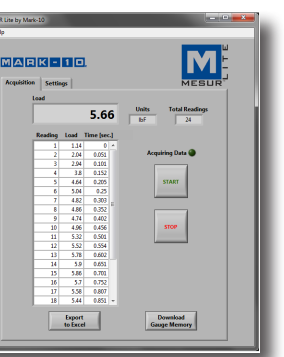
MESUR™ Lite data acquisition software is included with Series 7 gauges

Series 7 gauges include all the functions of Series 5 gauges, with several additional features, including high speed continuous data capture and storage, with memory for up to 5,000 readings at an acquisition rate of up to 14,000 Hz. The gauges also feature programmable footswitch sequencing,