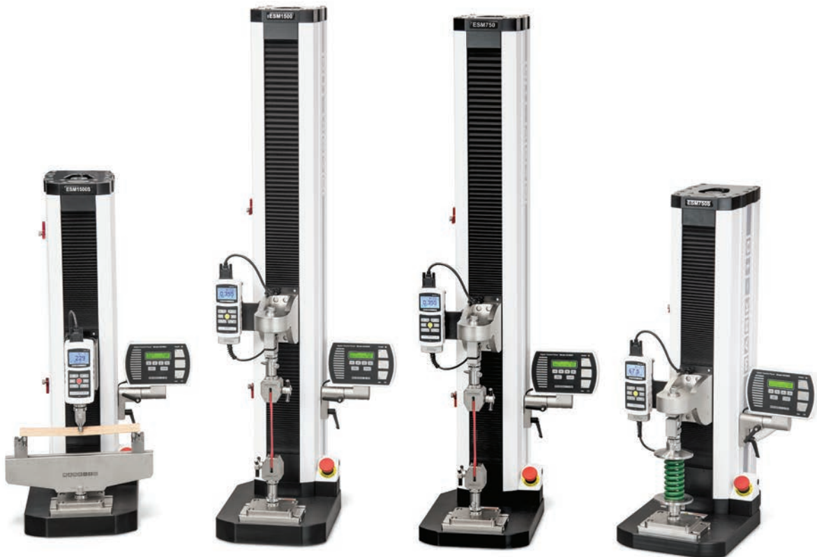
ESM1500S 1,500 lbF [6.7 kN] 14.2 in [360 mm] travel