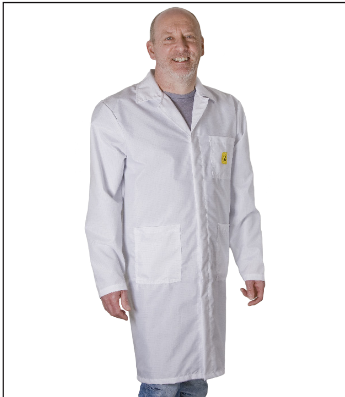
Figure 1. Charleswater Static Dissipative Lab Coat