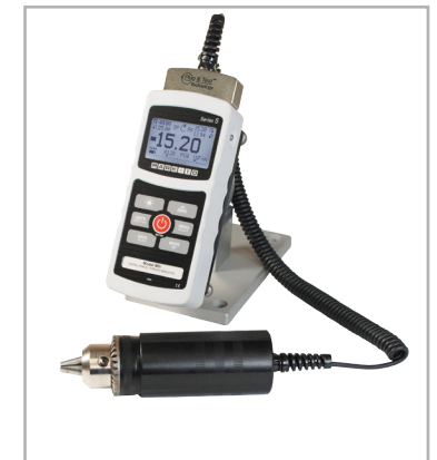
5i is shown mounted to an optional AC1008 tabletop stand with Series R50 torque sensor

The 5i includes MESUR™ Lite data acquisition software. MESUR™ Lite tabulates continuous or single point data. Data saved in the indicator's memory can also be downloaded in bulk. One-click export to Excel easily allows for further data manipulation.